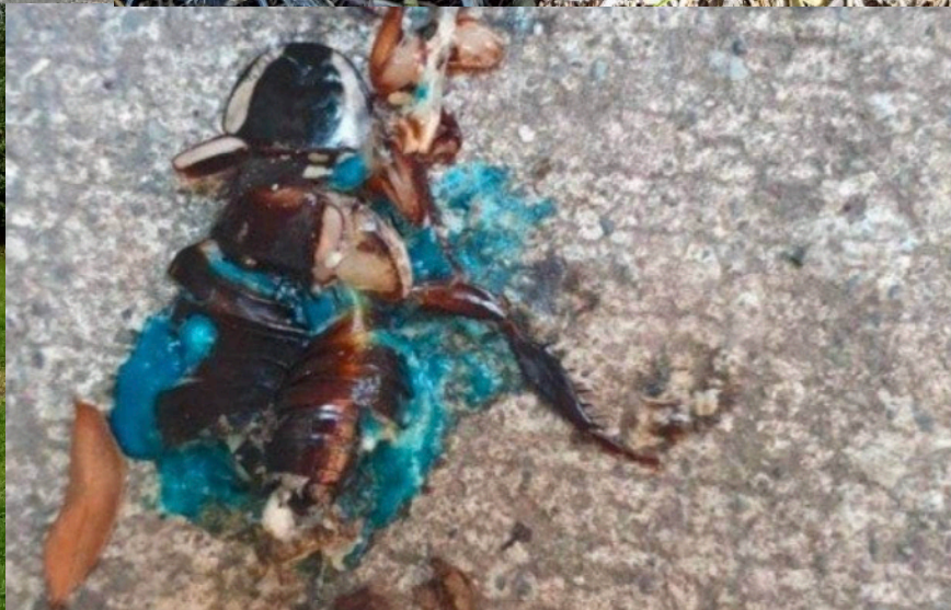
Top left to right: 1. DoC worker sprays vegetation at lakebed with “eco toxic” poisons. 2. Council contractor sprays unknown chemical around Kerikeri village and along sidewalk. 3. Heavily sprayed roadside on the school bus route, exposing children to toxic poisons. 4. Dead Kauri Snails on poisoned roadside. 5. Picnic table with spray burn around it. 6. Squashed cockroach with Brodifacoum in it from Stuff article on poisoned Tuatara (Cameron Hawken) Credits: Images 1 & 5 Jo A. Image 2 & 4 A. Andersen. Image 6 Cameron Hawken)